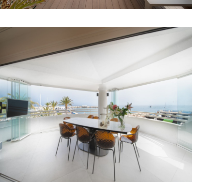
Community: 2,784 EUR / year