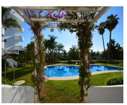
Ref.-ID: R4791730 The Golden Mile