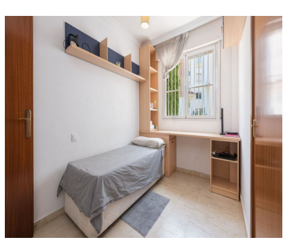
Ref.-ID: R4792090 Benalmadena