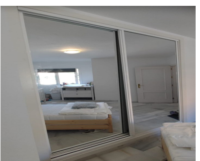
Ref.-ID: R4792120 Calahonda Apartment