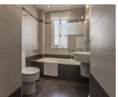
Riviera del Sol Apartment Ref.-ID: R4794424