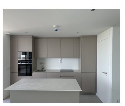
Ref.-ID: R4794493 Fuengirola Apartment