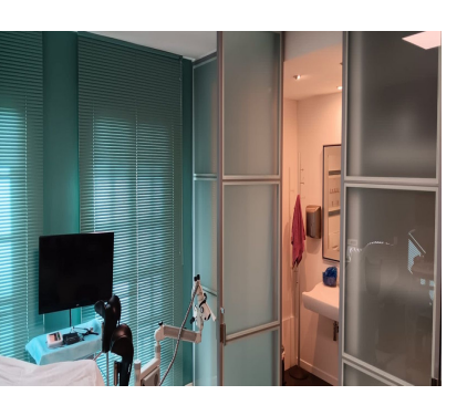
Ref.-ID: R4797892 Marbella Apartment