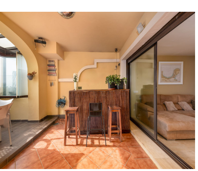
Ref.-ID: R4799311 Estepona Apartment