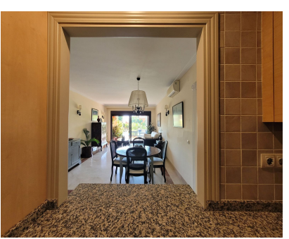
Ref.-ID: R4809115 Community: 1,800 EUR / year