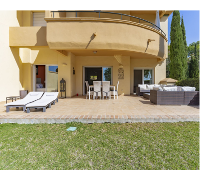
Elviria Ref.-ID: R4810237 Apartment