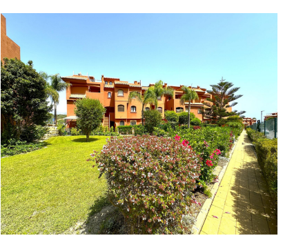
Ref.-ID: R4816249 Community: 1,800 EUR / year