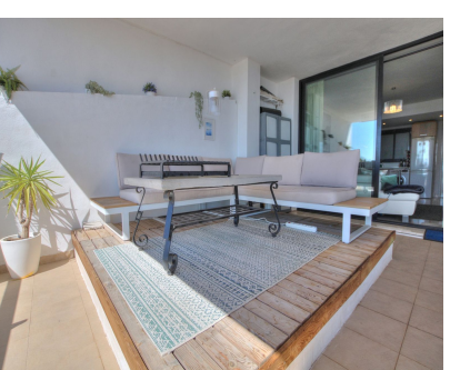
Ref.-ID: R4827631 Riviera del Sol