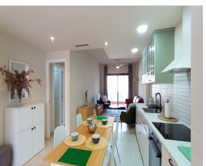
Ref.-ID: R4830646 Riviera del Sol