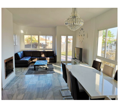
Ref.-ID: R4830715 Fuengirola House