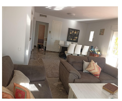
Ref.-ID: R4830808 Istán Apartment