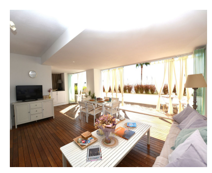
Ref.-ID: R4834075 Marbella Apartment