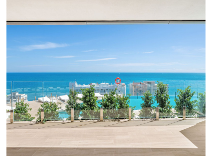
Ref.-ID: R4838053 Fuengirola Apartment