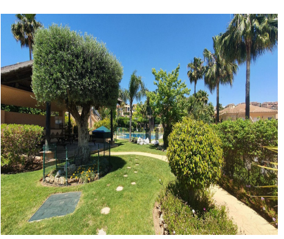
Ref.-ID: R4838692 Riviera del Sol House