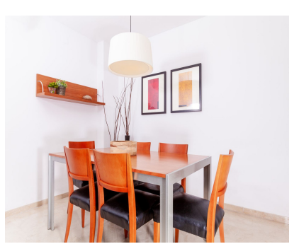
Ref.-ID: R4840822 Mijas Costa House