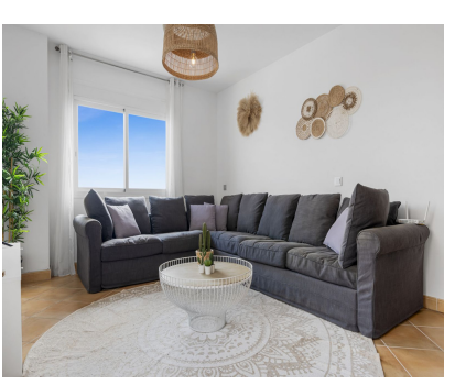
Ref.-ID: R4846906 La Cala de Mijas