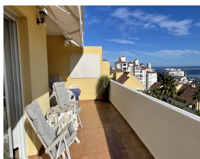
Ref.-ID: R4851268 Estepona Apartment