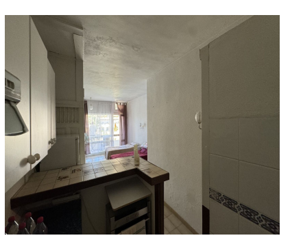
Ref.-ID: R4855000 Marbella Apartment