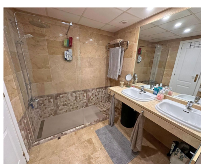
Community: 864 EUR / year