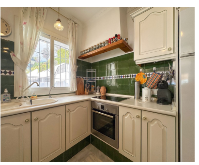
Mijas Apartment Ref.-ID: R4861513