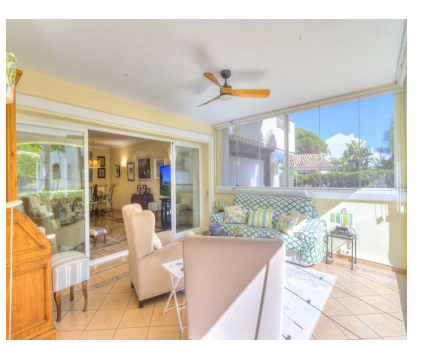
Ref.-ID: R4862494 Bahía de Marbella

Community: 1,896 EUR / year IBI: 1,132 EUR / year Rubbish: 184 EUR / year