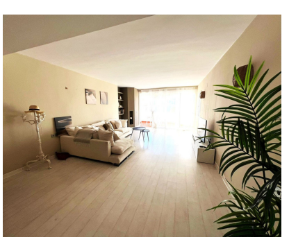
Ref.-ID: R4866697 Puerto Banús Apartment