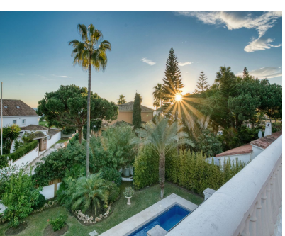
Elviria House Ref.-ID: R4866760