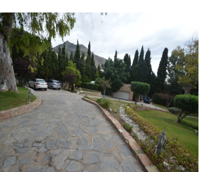
Ref.-ID: R4867915 Benalmadena House

Community: 1,776 EUR / year IBI: 8,600 EUR / year