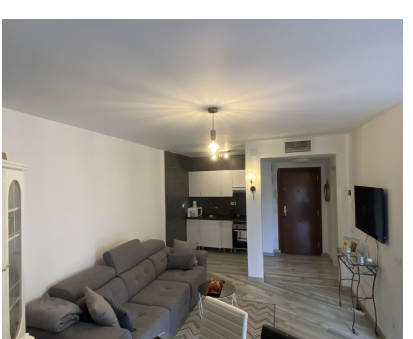
Ref.-ID: R4870186 Atalaya Apartment