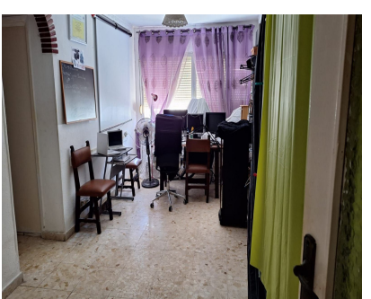
Ref.-ID: R4870972 Arroyo de la Miel