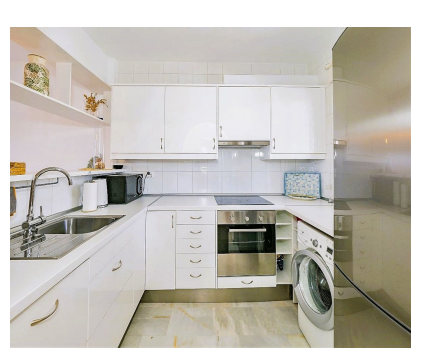
Ref.-ID: R4871881 Calahonda Apartment