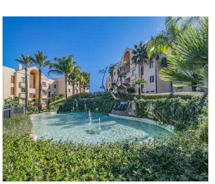
Ref.-ID: R4872616 Benahavís Apartment