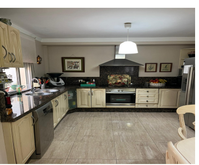
Estepona Ref.-ID: R4881661 House