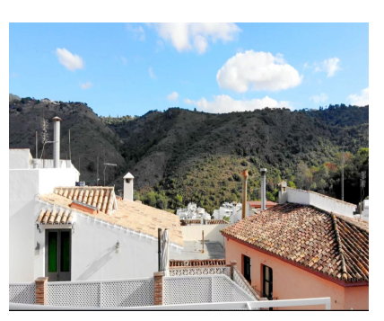
Ref.-ID: R4882153 Benahavís Apartment