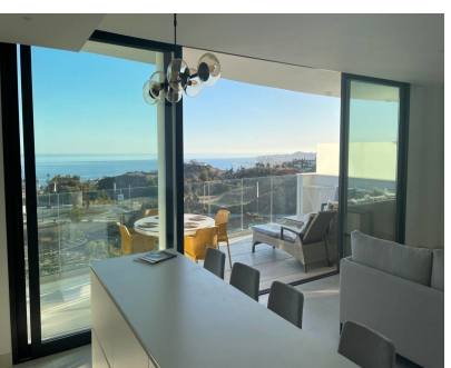
Ref.-ID: R4884328 Fuengirola Apartment