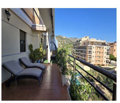
Ref.-ID: R4888201 El Pinillo Apartment