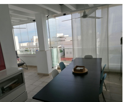
Ref.-ID: R4888375 Benalmadena Pueblo