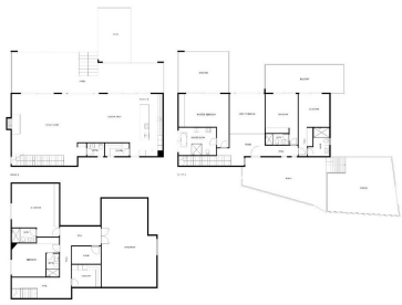
FIGURE APPROXIMATE, ACTUAL MAY VARY