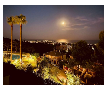
Ref.-ID: R4893412 Calahonda

Community: 1,788 EUR / year IBI: 579 EUR / year Rubbish: 78 EUR / year