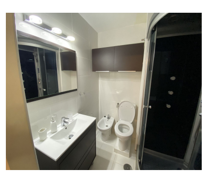
Arroyo de la Miel Ref.-ID: R4901602