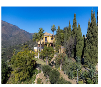
Ref.-ID: R4902142 Estepona House