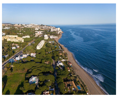
Ref.-ID: R4904542 Cabopino House

Community: 1,644 EUR / year IBI: 5,572 EUR / year