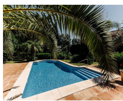
Ref.-ID: R4907305 Bahía de Marbella House

Community: 1,560 EUR / year IBI: 3,000 EUR / year