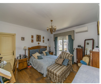
Ref.-ID: R4930066 Marbella Apartment