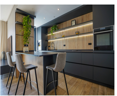
Ref.-ID: R4930606 Marbella Apartment

Community: 3,420 EUR / year IBI: 988 EUR / year