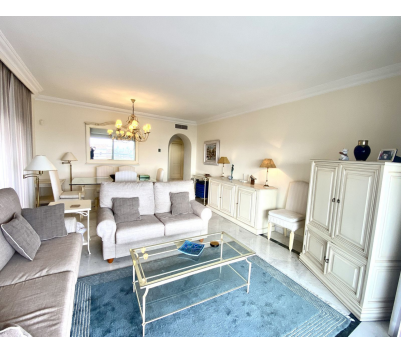
Ref.-ID: R4938502 Puerto Banús