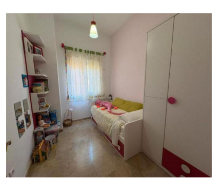
Ref.-ID: R4956154 Marbella Apartment