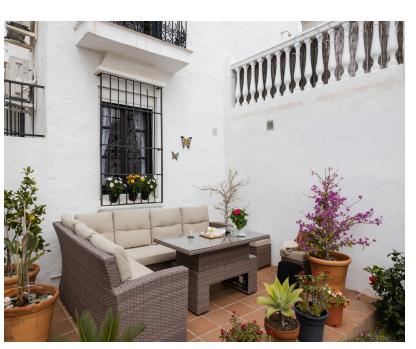
Ref.-ID: R4957849 Mijas Costa House