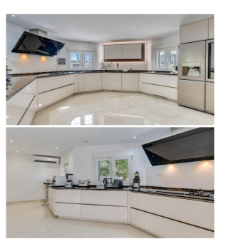
Ref.-ID: R4964827 Marbesa