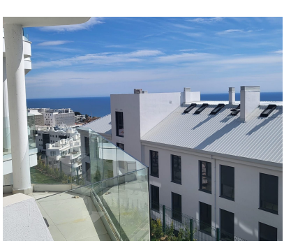
Fuengirola Apartment Ref.-ID: R4965928